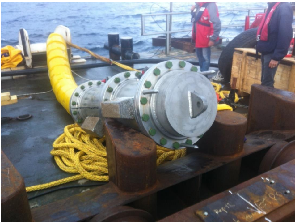
HRC ready to be deployed, June 2017